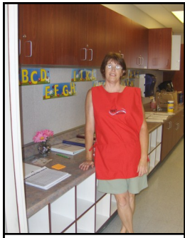
Our experienced staff is committed to your child's development.

2005 to offer a safe, loving, Christ-centered childcare for the two year old child who is in need of regular weekly child care. This service is offered to all members of