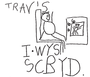
"I watched Scooby Doo."