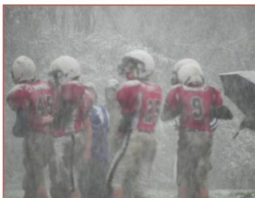
Saint Denis Varsity Football Vs. Saint Katherine's Oct. 29