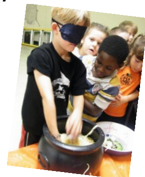
pot luck ?

The SJCS Cooking Club is held every Wednesday afternoon from 3 - 4:15. K - 3 meets one week and 4-7 meets the following week. The older children have learned how to make lasagna, homemade Italian gravy and traditional Thanksgiving side dishes. The younger children have decorated cupcakes, made homemade hot chocolate, a dessert called death by chocolate, macaroni and cheese, and pigs in a blanket. Look out Rachel Ray!