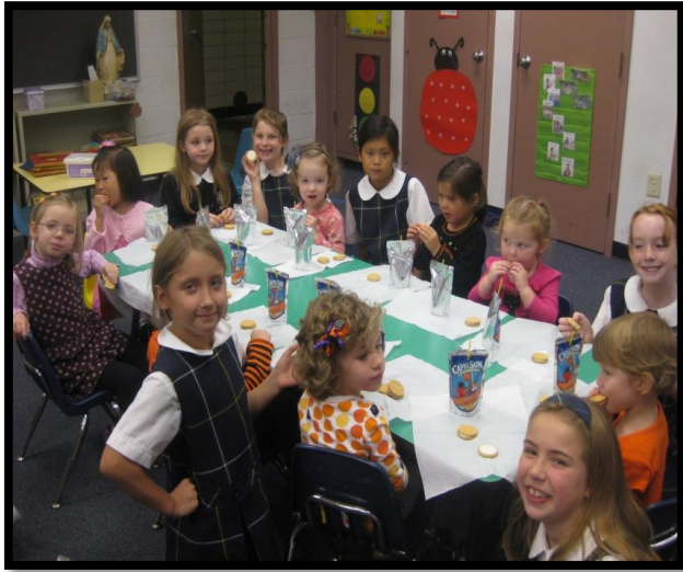
Who says school is all work and no play? Not these prayer partners! Treats are encouraged at most PP activities !