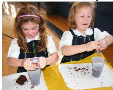
death by chocolate