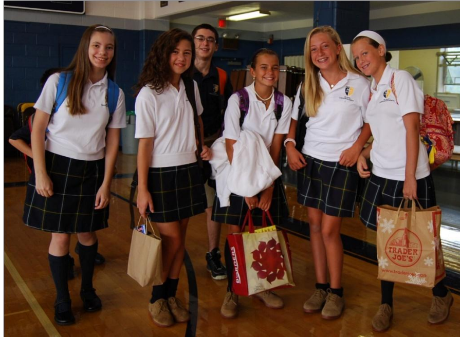
Seventh graders (above) & fifth graders (below) on the first day of school.

May God bless all of you throughout the coming year!