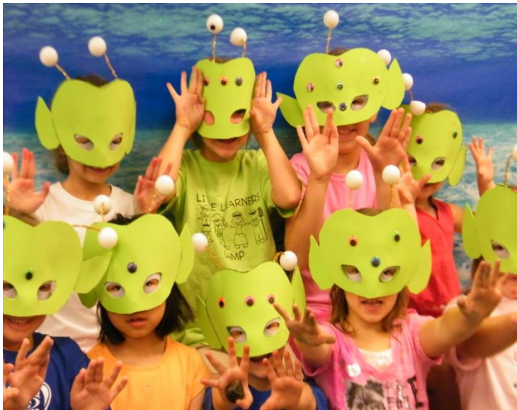
May the force be with you! Take me to your leader!