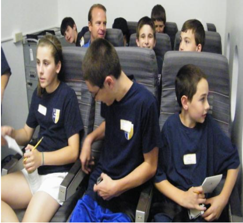
Biz Town workers fly business class